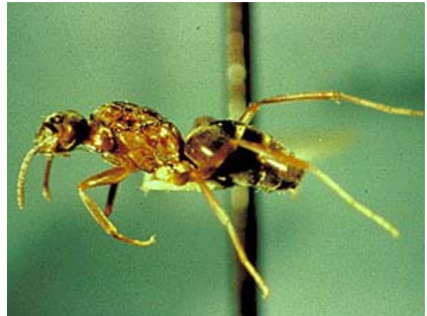
Odorous House Ant (EPA)

Adult winged males and females emerge from their cocoons and eventually leave the nests. Emergence of large numbers of ants (swarming) usually occurs at certain times, and often this is the only time we notice the ants at all. Males seek out females in the swarm; mating usually occurs in the air. Males die soon after the mating flight, while the female seeks out a crevice or similar hiding place. She then removes her wings, forms a small cell, and lays a few eggs. The eggs hatch into tiny, white, legless grubs. The queen feeds these grubs, or larvae, with a nutritious fluid that forms in her digestive system. When the grubs are fully-grown, they change into a nonfeeding pupal stage from which emerge the common "worker" ants. These workers begin to forage for food, some of which is fed to the queen and some to the new larvae from the next lot of eggs. Adult workers may live for weeks,