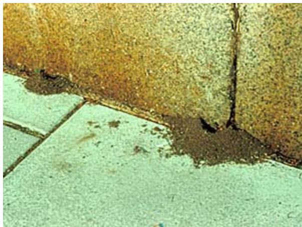
Pavement ant mounds (EPA)

small house ants. Traps will take from 24 to 48 hours to work, so be patient. If used correctly, most ants will be controlled without having to apply any insecticides in the home.