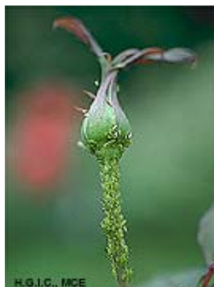
Aphids on rose