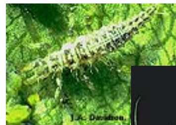
Lacewing larva and adult