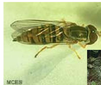
Flower fly adult and larva