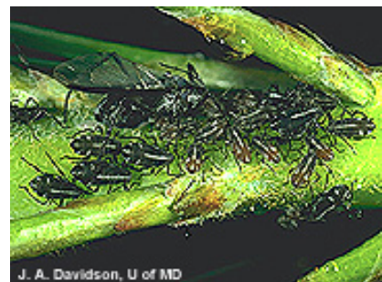
White pine aphids